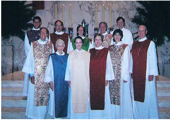
Board Members with the New Guild Banner